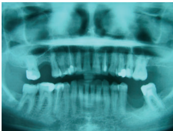
Figure 6 Radiographic appearance of 36 region at 10 months.