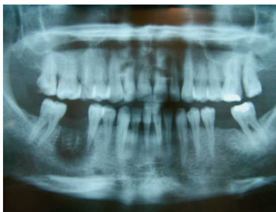
Figure 1 Panoramic radiograph showing an extensive bony radiolucency in teeth 46 and 45.

A 38-year-old woman was referred in October 2004 to Ataturk University, Faculty of Dentistry, Department of Oral and Maxillofacial Surgery complaining of constant pain and oedema of the right cheek. The history confirmed that her dentist had applied an arsenic paste to tooth 46 pulp during root canal treatment because of unsuccessful local anaesthesia. The next day, the patient experienced severe and increasing pain and the dentist extracted tooth 46 at her second appointment. However, the patient's complaints did not resolve, and the dentist recommended her to consult with a specialist. On presentation, a sequestrum affecting the second premolar at the extraction site was noted. Panoramic radiography revealed a radiolucent area in the tooth 46 and 45 region (Fig. 1). Further treatment included the removal of tooth 45 and localized sequestrectomy under local anaesthesia (Fig. 2). Primary closure of the wound was secured with a 3-0 silk suture. A course of oral amoxicillin trihydrate 825 mg plus potassium clavulanate 125 mg was given twice a day for 10 days. Additionally, the patient received oral naproxen sodium 550 mg as an analgesic and chlorhexidine gluconate as a mouthwash two times a day for 5 days. A soft diet was advised during the first postoperative week, and the patient was recalled to evaluate healing. Although the clinical examination confirmed painless healing, a panoramic radiograph