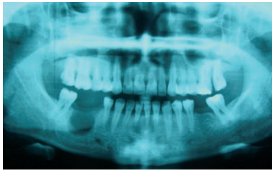
Figure 3 Orthopantomograph showing a persistent bony defect although the patient was asymptomatic.

showed bony healing in the 45 region but a substantial, persistent bony lucency in the 46 area (Fig. 3).