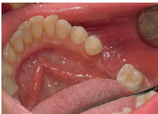
Figure 5 Intraoral appearance of operation site at 10 months.